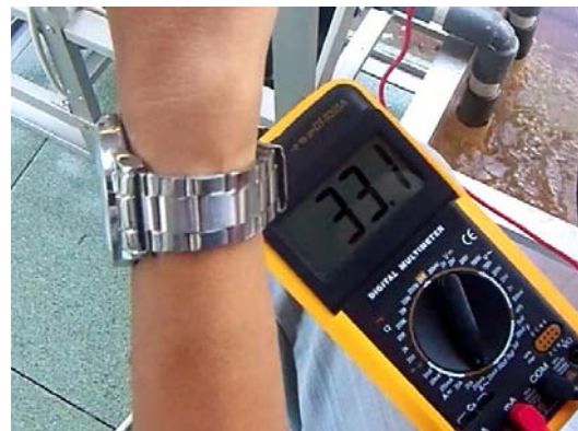
Figure 6 Measuring current