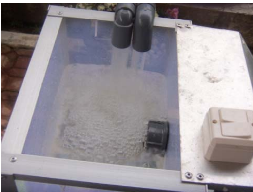
Figure 3 Inlet reservoir

To make sure that electricity is really generated by this device, not only some led lamps is installed on bicycle generator is on, but also measured by using multimeter to show how much current and voltage are generated. (figure 4, 5 and 6).