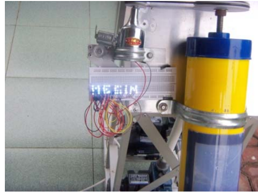
Figure 4 Led lamps

To make sure that electricity is really generated by this device, not only some led lamps is installed on bicycle generator is on, but also measured by using multimeter to show how much current and voltage are generated. (figure 4, 5 and 6).