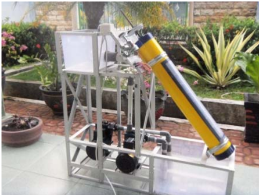
Figure 2 Prototype of Screw turbine

Screw turbine prototype is made by using locally available materials. PVC pipe with 4 in diameter is used as duct (trough), aluminum is used as screw blade and joined by using rivetted. Turbine is installed with elevation of through ( \alpha ) 45°. Two reservoirs and two pumps is used to keep flow rate constant (figure 2 and 3).