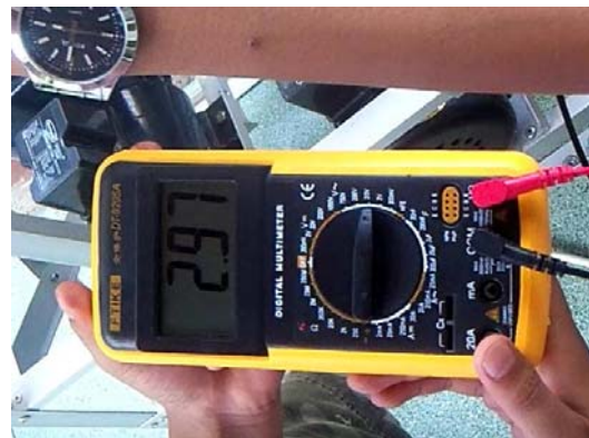
Figure 5 Measuring voltage